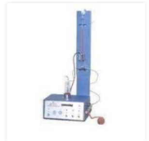
Auto Karl Fischer Titration Apparatus for Moisture Analyser