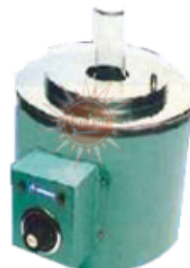
Round Thermostatic Control Water Bath