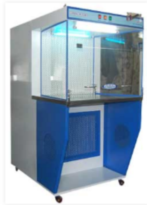
Horizontal Laminar Air Flow 31