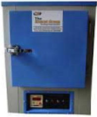
Hot Air Oven