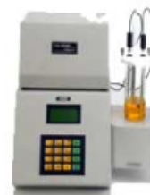
Automatic Karl Fisher Titration Apparatus