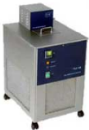
Kinematic Low Temperature Viscosity Bath