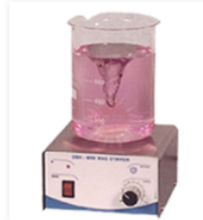
Mini Magnetic Stirrer 30