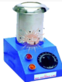
Electric Bunsen Burner with Electric Box