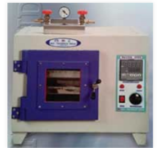
Vacuum Oven Rectangular 53