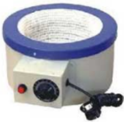
Heating Mantle with Regulator