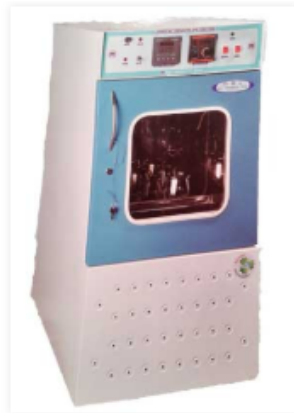
Orbital Shaking Incubator