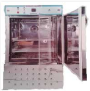
Humidity Oven Gmp Model Stability Chamber 24 A