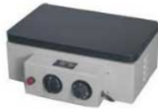
Hot Plate Rectangular