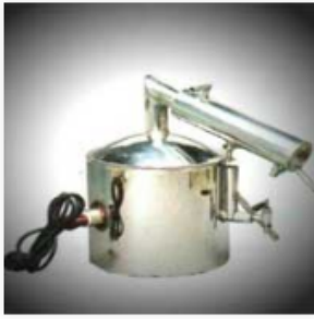
Water Still Barnstead Pattern Type