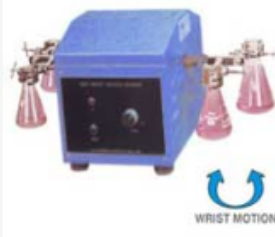
Griffin Flask Shaker